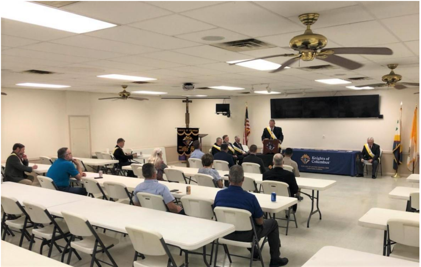
Candidates and Audience