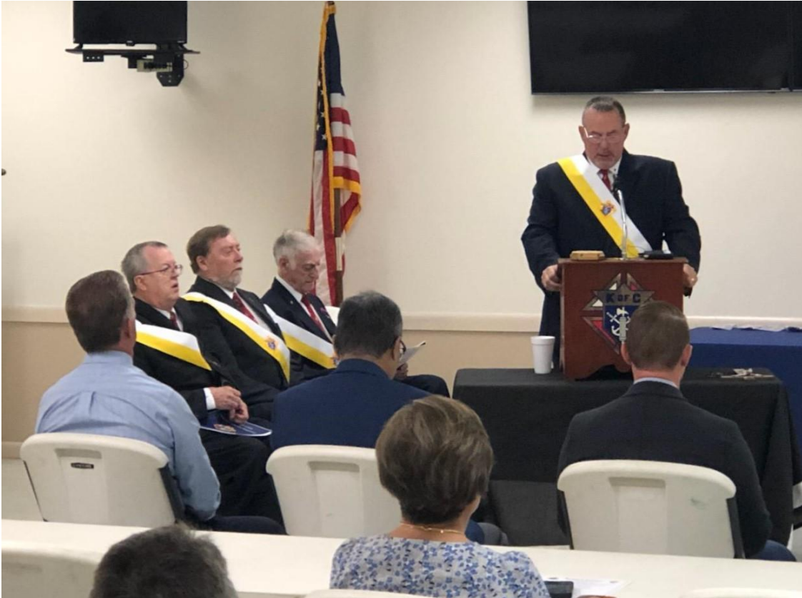
Degree Team Members

April 22 nd , 2022, Our Lady of Victory Council 7968 Degree Team hosted an Initiation Degree attended by four (4) Candidates and family members.