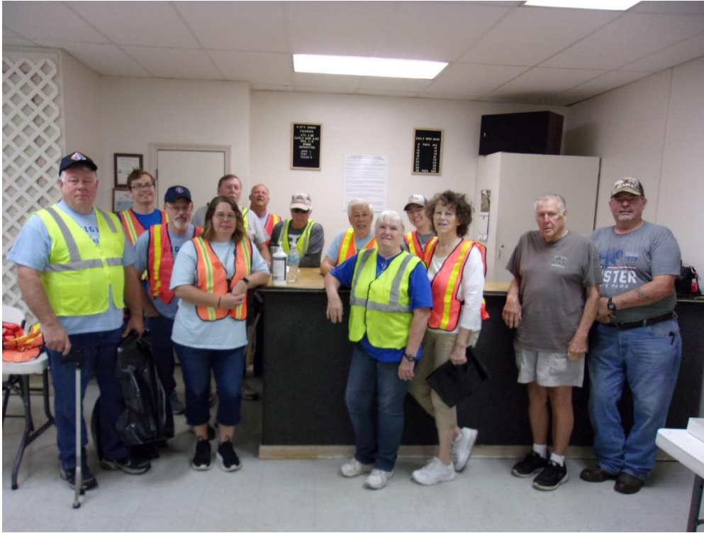
The fourteen workers to include Herb Fosman (Photographer)

Brother John Mehalopoulos, the Knights Highway Cleanup Chief, scheduled us for Highway Cleanup on Saturday 16 Apr 22. Eleven Knights and family members showed up prior to 7:00 AM. Those who showed up enjoyed some good coffee and donuts and at 7:00 AM headed out the door to help clean up our two-mile area of Highway. After Highway Cleanup, like always, the workers enjoyed a SUPER breakfast consisting of eggs, biscuit and gravy, tater tots, sausages, orange juice and coffee. We were all lucky that we all finished when we did. Shortly thereafter, the scheduled rain came pouring down.