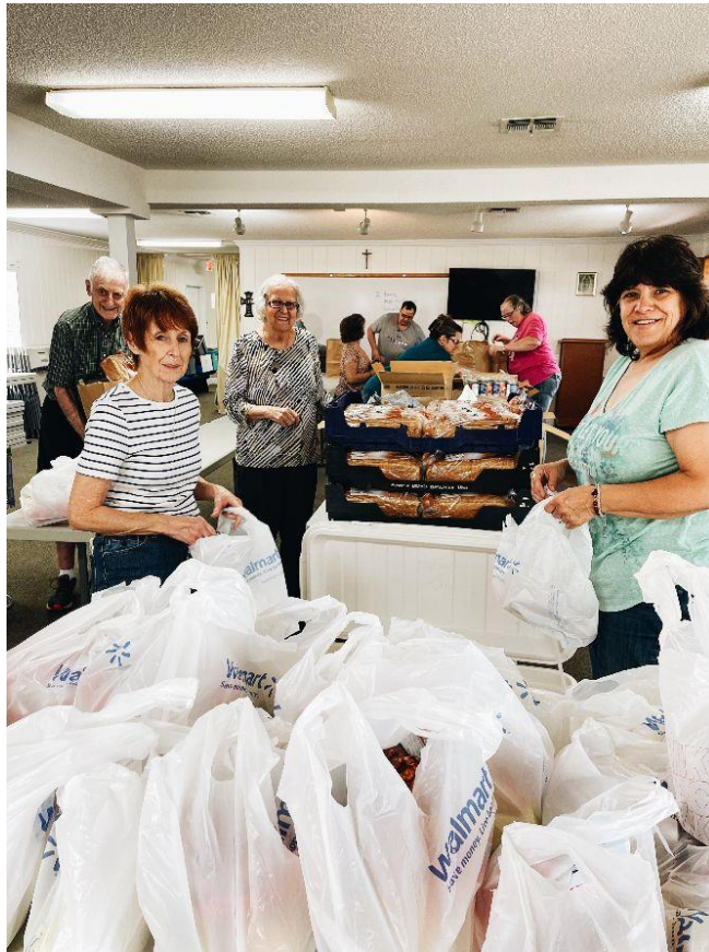
Parish crew packing the bags with a week's supply of food.