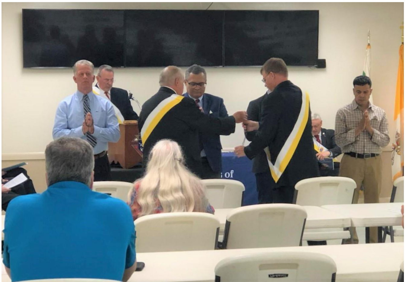
Candidates receiving their rosaries.