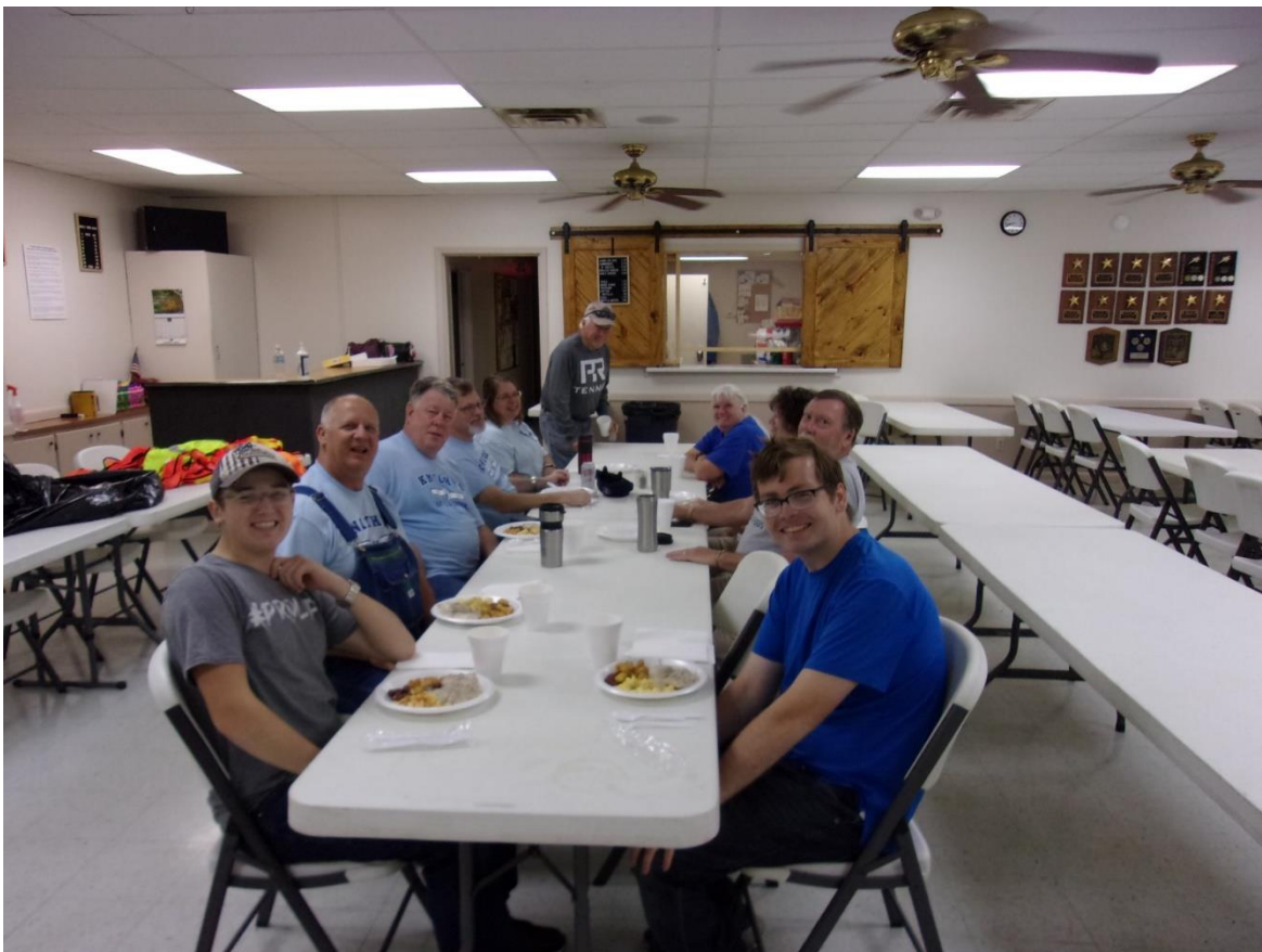
Picture 4 - The workers enjoying a well-deserved meal