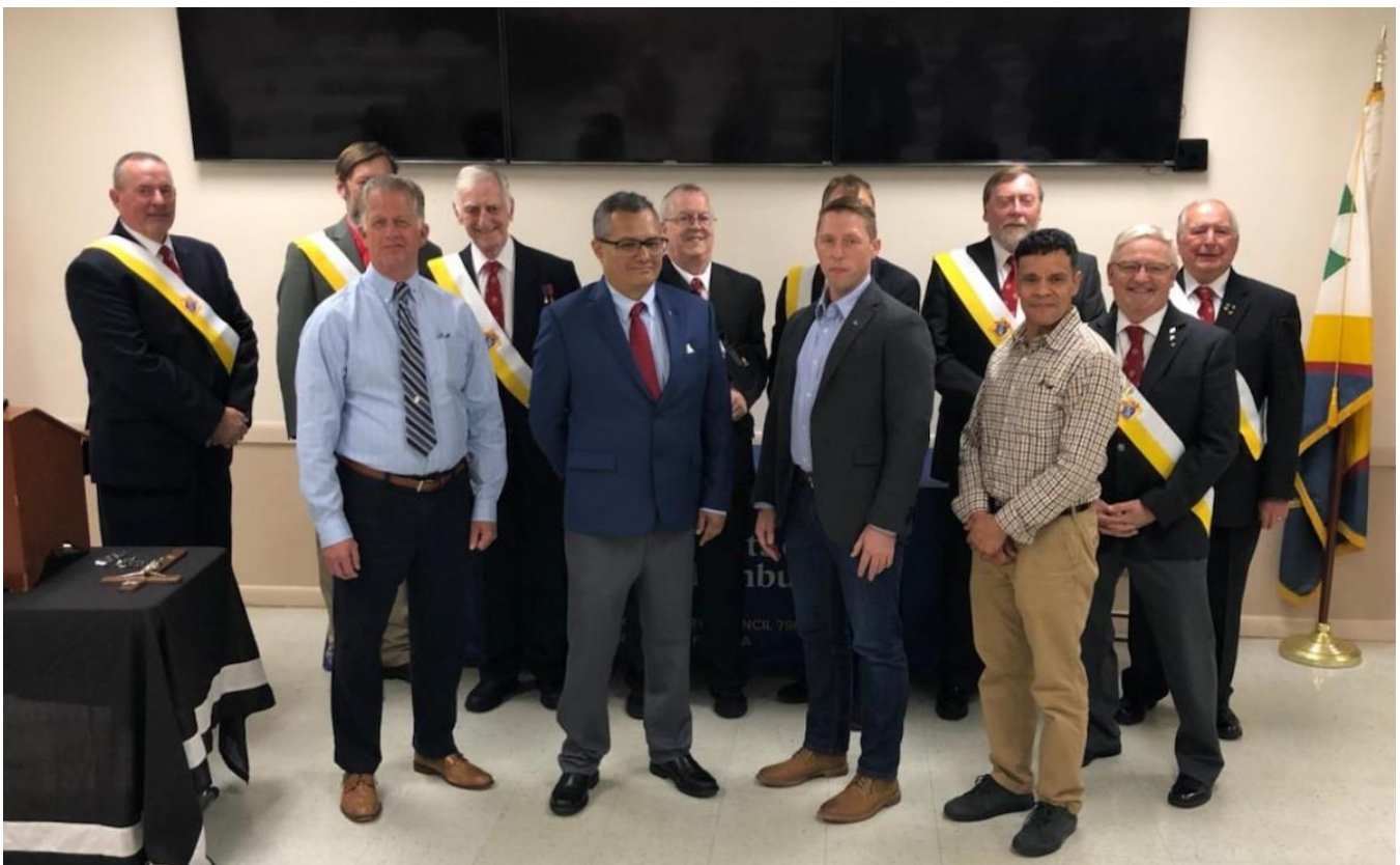
New Knights and Degree Team Members