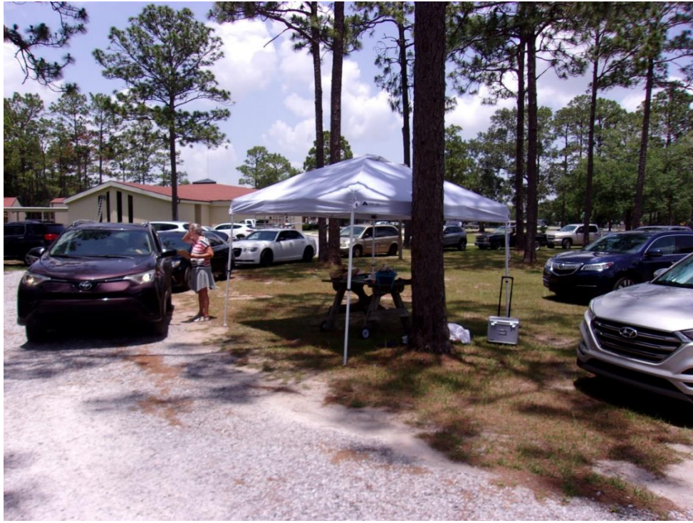
Traffic coming into the area.