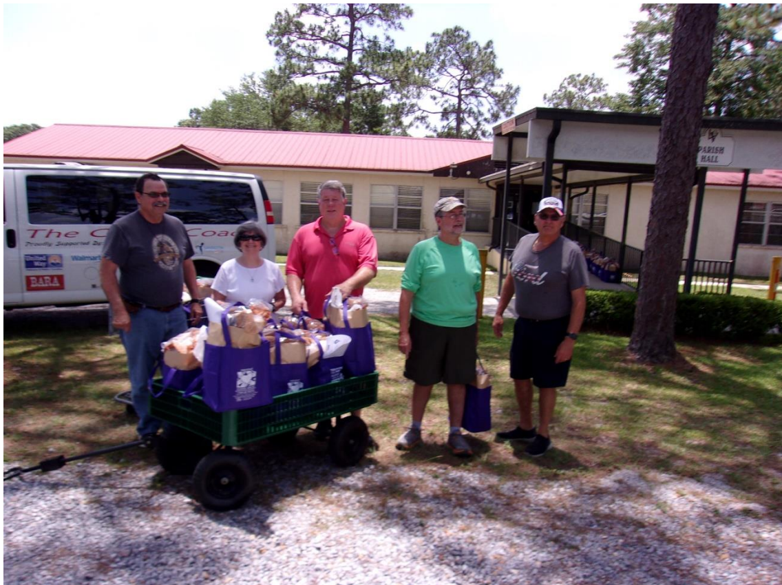
Getting ready to issue the bags.