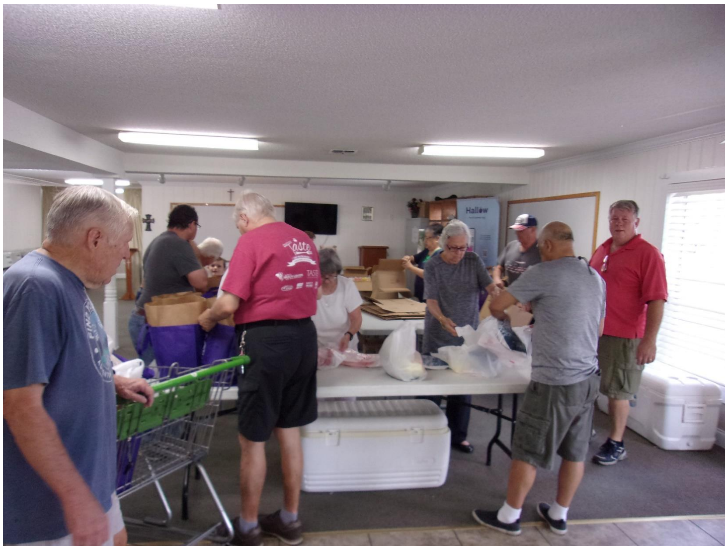
Filling the bags with a week's supply of food.

On Tuesday, 14 June 2022, the Catholic Charities of Northwest Florida delivered food to the Parish Hall. Hundreds of pounds of all kinds of food offloaded from the Catholic Charities truck into the Parish Hall where the food was separated and packed into bags that provided a week's supply of food. The volunteers enjoyed the work they were doing in support of a lot of people. In May we supported about fifty families, but on 14 Jun the number was sixty-seven families. The next Catholic Charities event will be on 12 Jul. Mark your calendars and come help out at 11:45 AM. Following the event, we get to enjoy pizza, drinks and dessert.