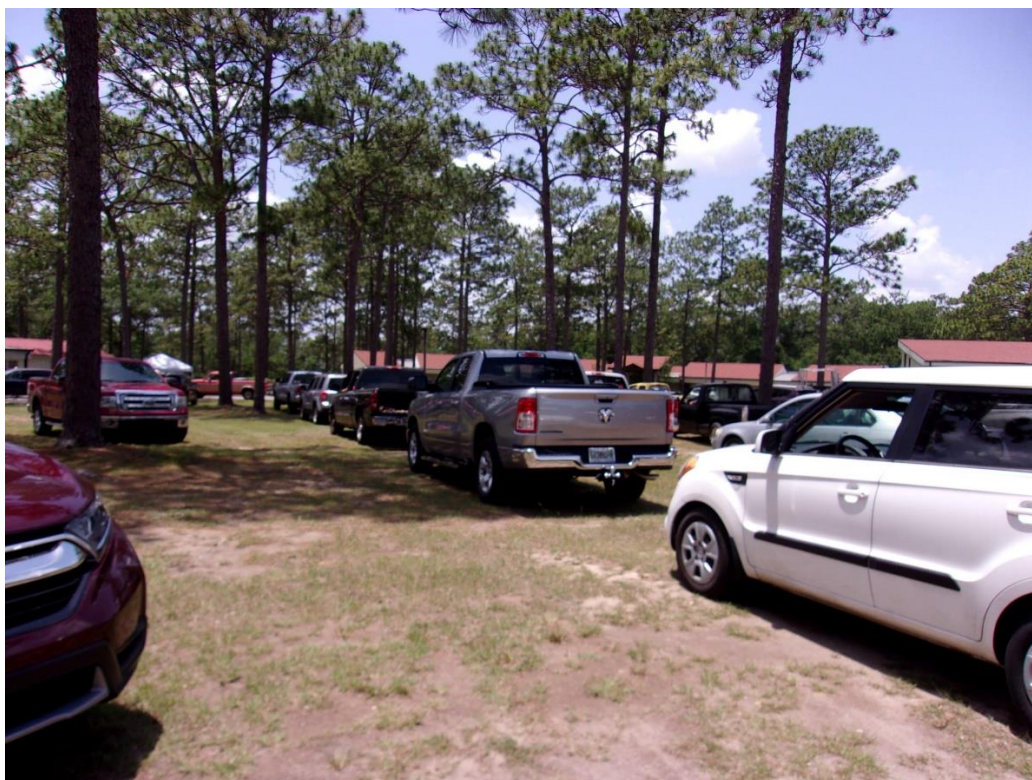
Traffic coming into the area.