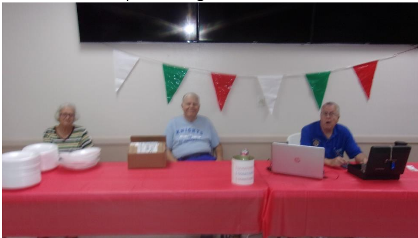
Picture 3 - The serving crew