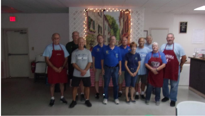
Picture 2 - The in-processing crew