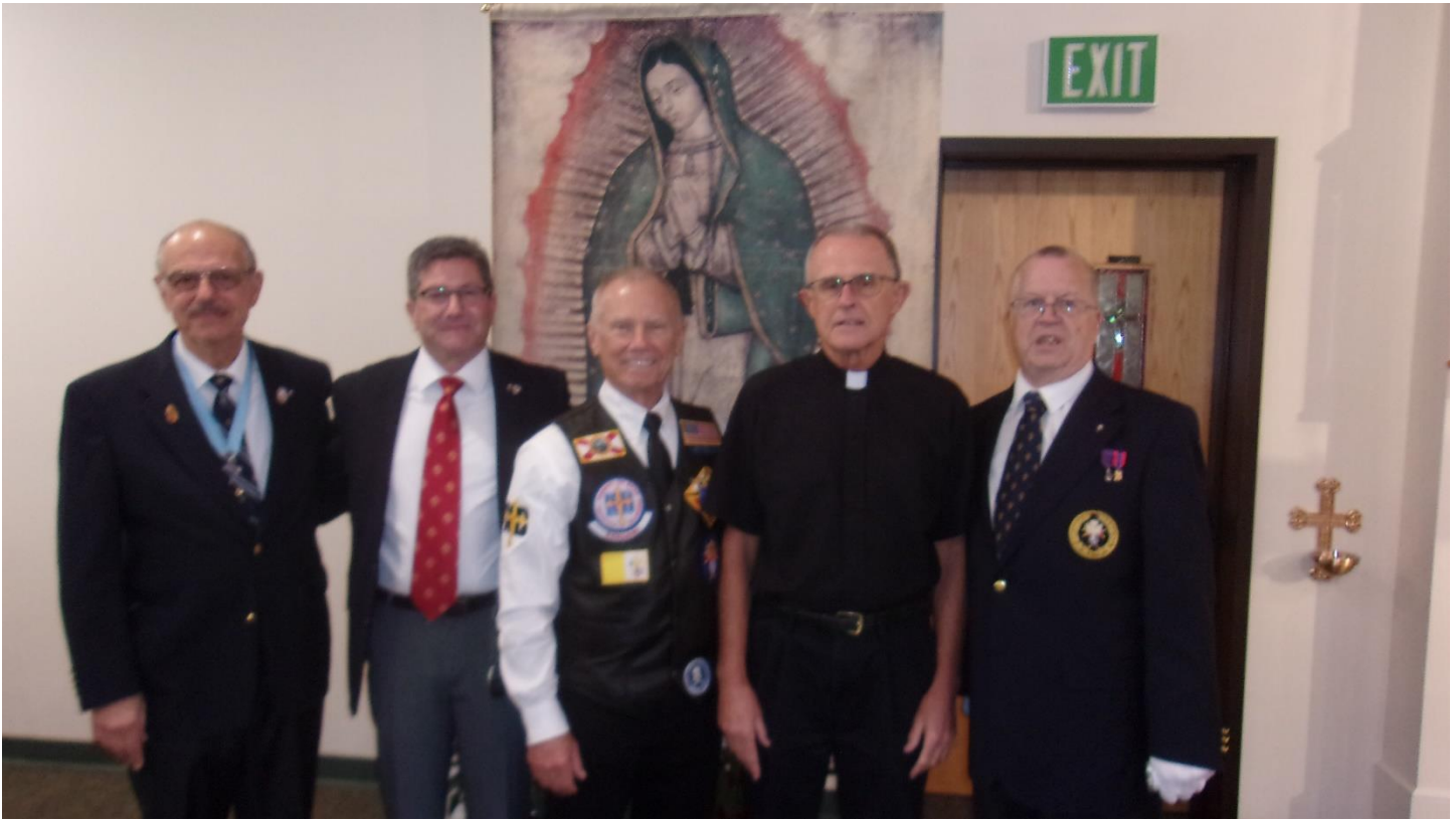
Picture 3 - Participating Knights and there were a couple more.