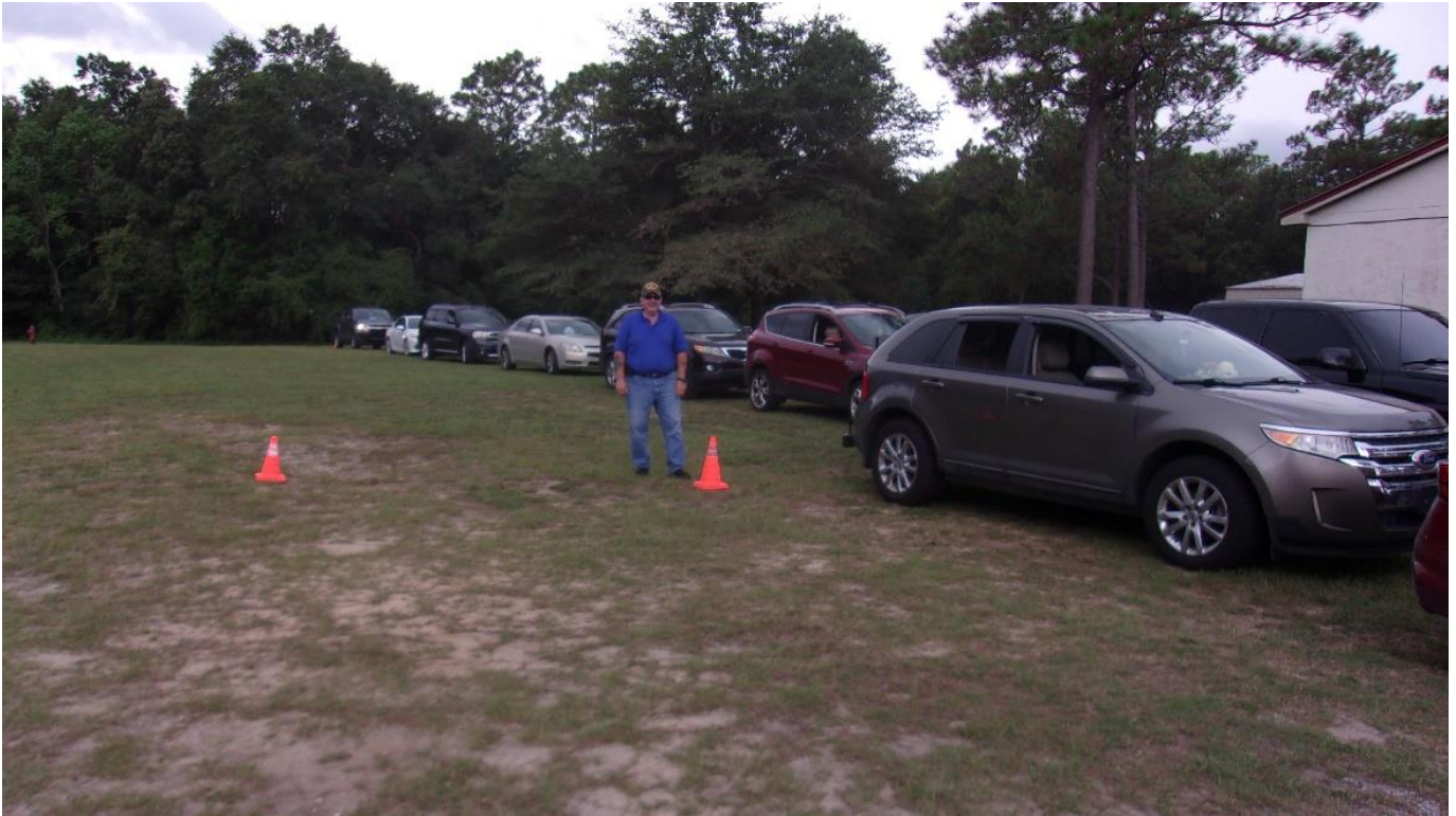
Picture 4 - Issuing the food bags.