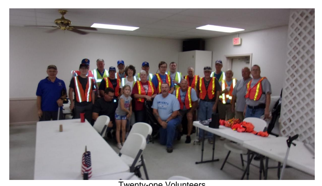
Twenty-one Volunteers Herb took the picture and two more showed up after the picture was taken for a total of twenty-four helpers.