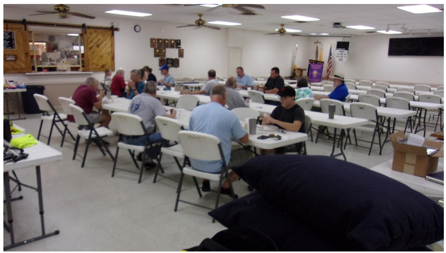
Time to eat and enjoy a great breakfast.