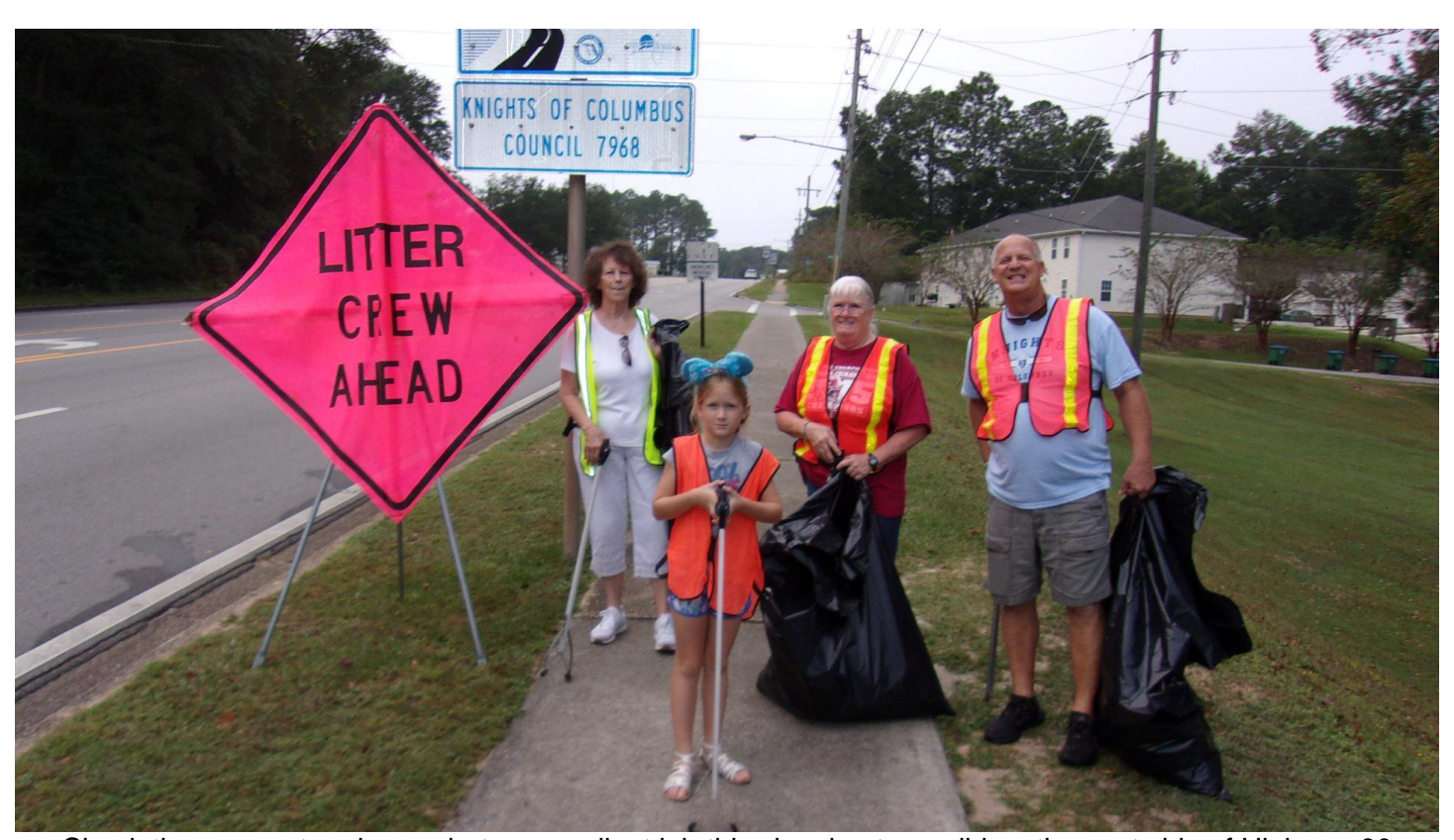
Check the area out and see what an excellent job this cleaning team did on the east side of Highway 90