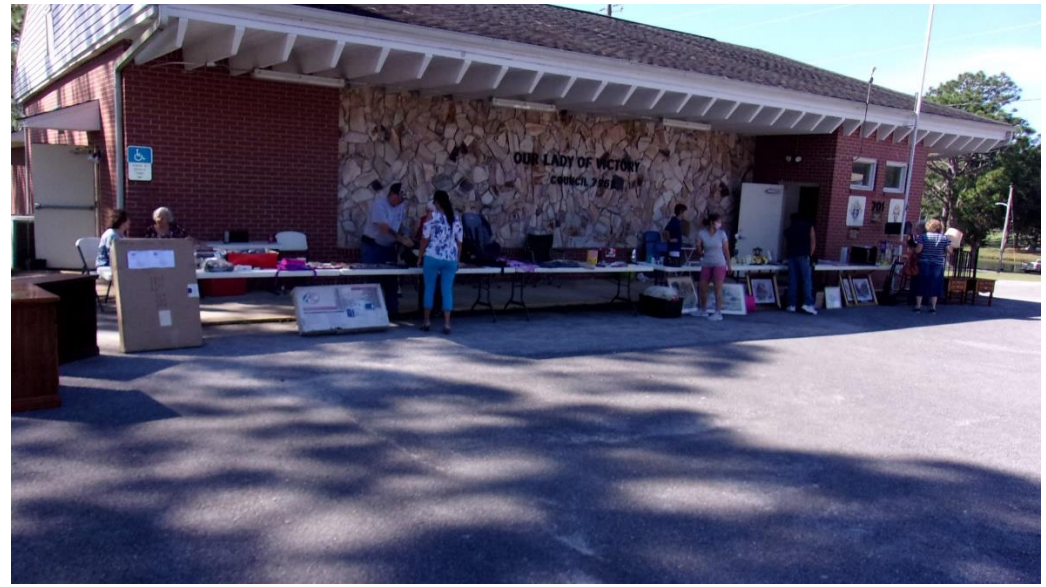
Pictures 1 through 3 - The sale of the Gene and Faylene Calabro donations