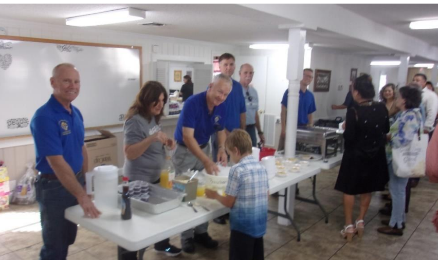
Picture 4 - Knights and their wife's serving the food.