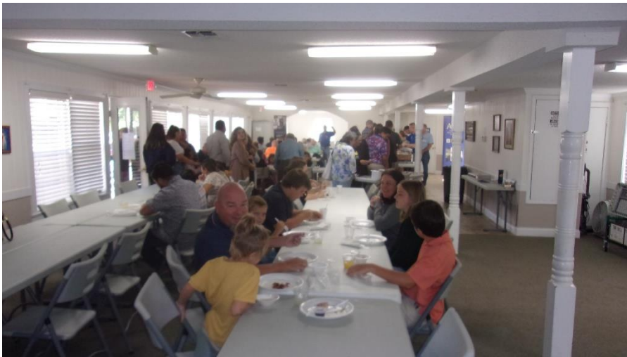
Picture 2 - Some of the crowd following the 9AM Mass.