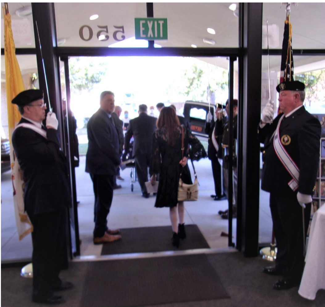
Knights saluting the casket and family as they depart the Church